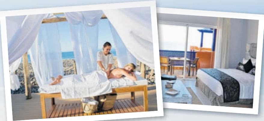
SUITE DREAM . . . with ocean view