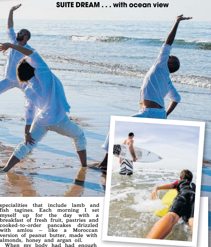
SPLASH COURSE . . . learning to surf

specialities that include lamb and fish tagines. Each morning I set myself up for the day with a breakfast of fresh fruit, pastries and cooked-to-order pancakes drizzled with amlou – like a Moroccan version of peanut butter, made with almonds, honey and argan oil. When my body had had enough of being smashed by waves, I soothed it in the spa's hammam, unwinding as the steam filled the room.